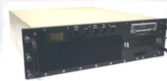
RS375i 20" deep