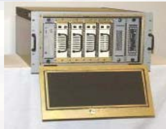
R550i Flexible Enclosure any ATX or ATX-E Motherboard and up to 3.5" drives