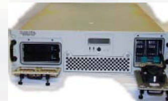
R350i 27" deep