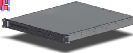
RS189i Rugged 1U – 20" depth