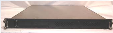
RS180i Rugged 1U 20" deep Dual Xeon CPUs Up to 2 x 3.5" HDD