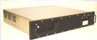
RS290i 15" deep