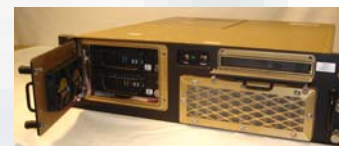
RS250i 20" deep