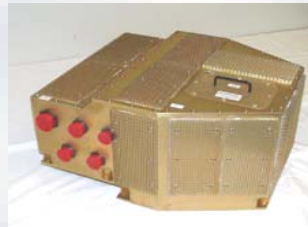
HP Server Packaged For Predator UAV