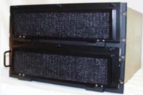
Rugged Dell Blade Server