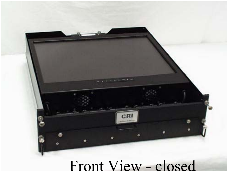
Front View - closed