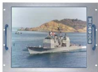
RLCD19-8U 19" Rack Mount