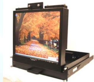
LCD19-T 19" 2U Tray Mount