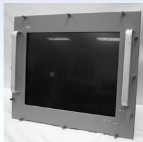
LCD20-P 20" Panel Mount LCD