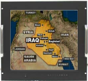
RLCD20 20.1" Rack Mount