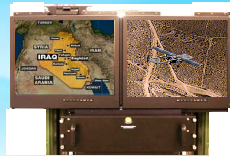
RLCD19-2-T Dual 19" FPD Drawer Mount