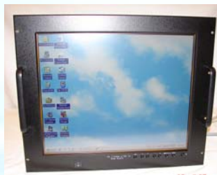
RLCD19 19" Rack Mount